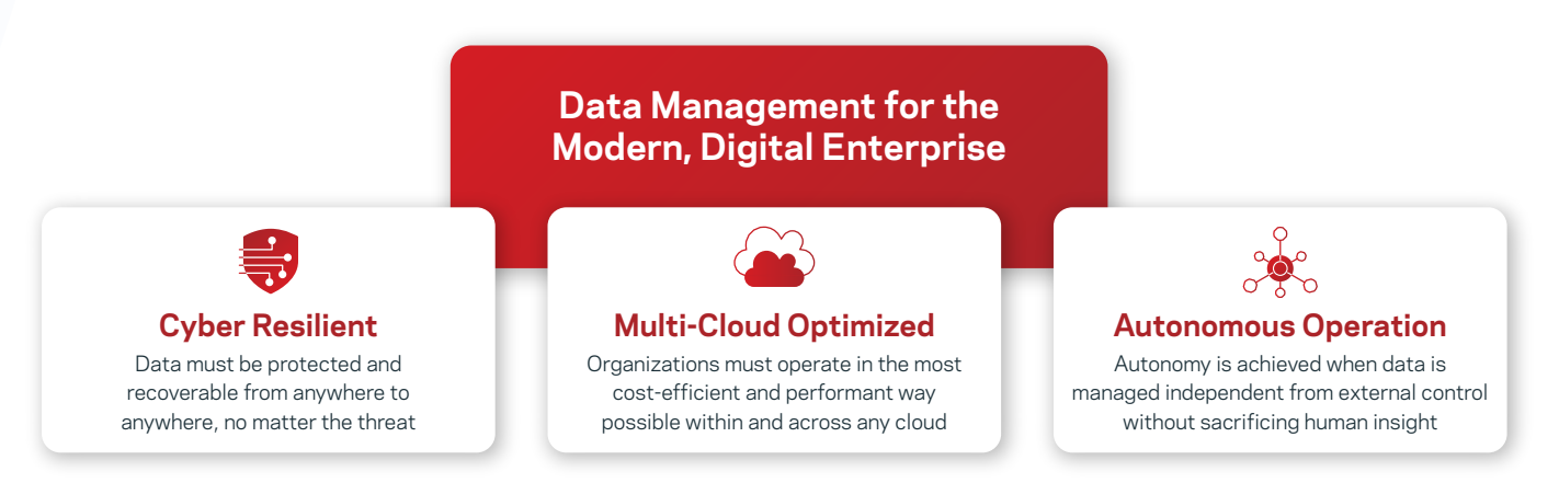
Figure 4. The core characteristics for the future of data management.

Enterprises in pursuit of digital transformation are accelerating their multi-cloud strategies. Yet, today's enterprise data management solutions are ill-equipped to meet the challenge of managing and protecting their data in multi-cloud environments. Veritas NetBackup, powered by Cloud Scale Technology is delivering the industry's first Al-powered autonomous data management solution delivered on a cyber-resilient, multi-cloud-optimized, and ultimately autonomously operated platform (See Figure 4).