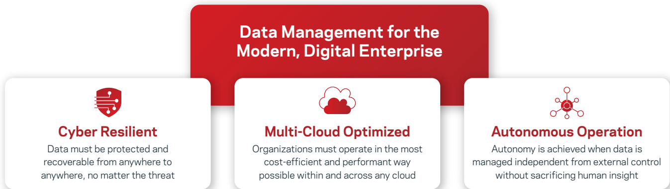
Figure 4. The core characteristics for the future of data management.

Enterprises in pursuit of digital transformation are accelerating their multi-cloud strategies. Yet, today's enterprise data management solutions are ill-equipped to meet the challenge of managing and protecting their data in multi-cloud environments. Veritas Cloud Scale Technology is delivering the industry's first AI-powered autonomous data management solution delivered on a cyber-resilient, multi-cloud-optimized, and ultimately autonomously operated platform (See Figure 4).