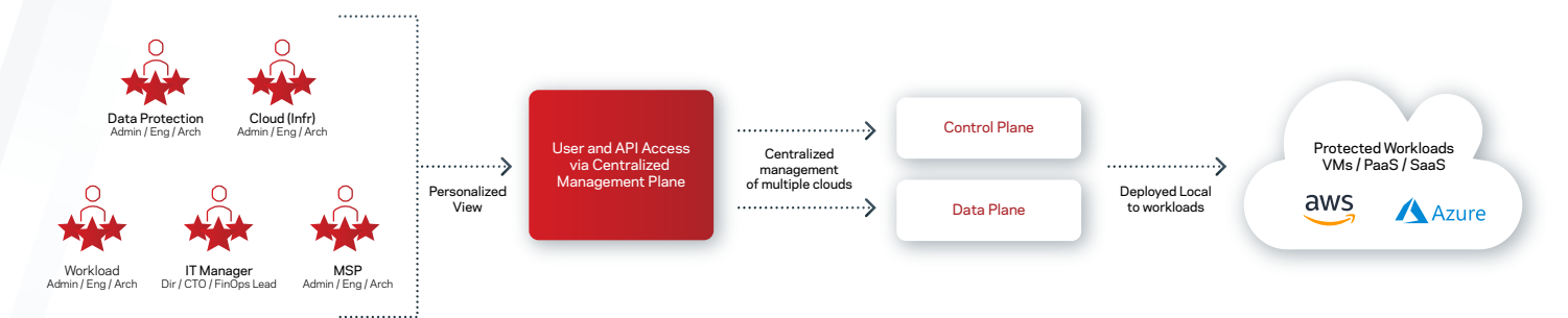
Figure 2. Veritas Alta's architecture delivers security and control at all layers

Veritas Alta Backup as a Service is a cloud-native data protection solution that is part of the Veritas Alta™ cloud data management platform.