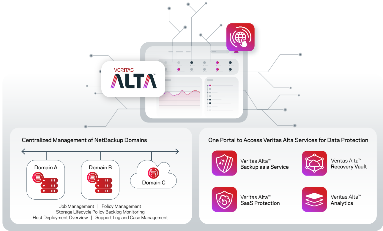
Figure 1. A unified portal, secured by default, to manage all your data protection services