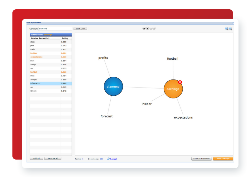
Figure 2. Concept search explorer: Provides a visual interface to dynamically explore and discover new, relevant concepts.

Classification—The Veritas Information Classifier performs a full text index of all data it is analyzing, and stores this information in an internal database. During this analysis it searches for text that matches the conditions in the classification policies. If it finds a match, it adds the appropriate classification tag to the information it stores about the data. You can use the index of text, classification tags and metadata to search within the data to identify all items that apply to the investigation. You can then use this information for early case assessment, which provides easy filtering of the collection, ensuring a streamlined list of documents for review.