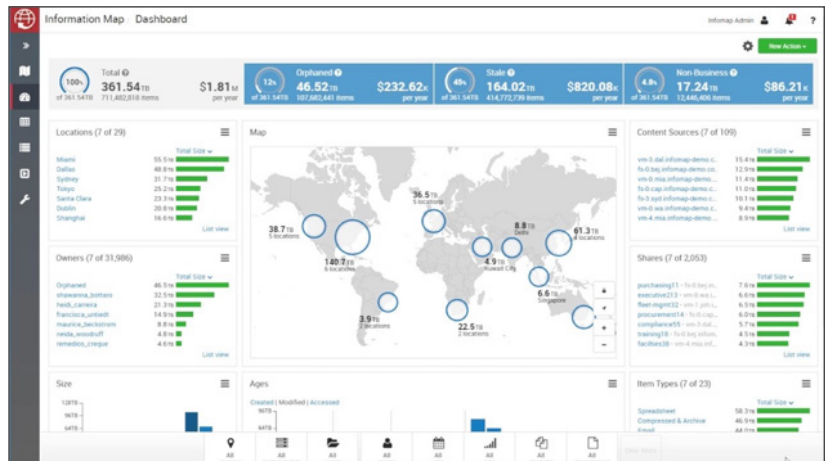
Figure 1: Veritas offers a range of capabilities for IBM Business Resiliency Backup as a Service, including Information Map shown here, to enable the IT operator to quickly see and understand their data, on-premises or in the cloud.

The close integration of Veritas NetBackup and IBM Cloud services also supports additional integration with other elements of Veritas 360 Data Management. As a result, users can easily take advantage of functionality such as integration with Veritas Information Map (Figure 1), a powerful set of immersive visualization tools for generating truly meaningful insights from your data. Information Map aggregates a comprehensive view of your IBM BaaS environment to help answer such questions as whether your data is protected appropriately, whether it can or should be deleted, and whether you're missing less expensive storage opportunities.